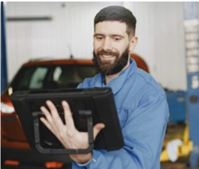
Remote Car Service